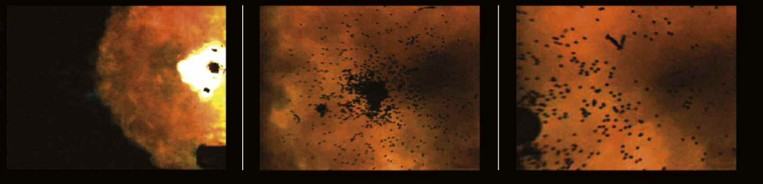
M1028 Canister Cartridge Flying Downrange

The M1028 120mm Canister Cartridge completed the System Development and Demonstration (SDD) qualification phase in 2004. Low-rate production is scheduled to begin in 2005. This cartridge is being developed for close-in defense of tanks against massed assaulting infantry attack and to break up infantry concentrations, between a range of 200-500 meters, by discharging large numbers of tungsten balls from the main cannon.