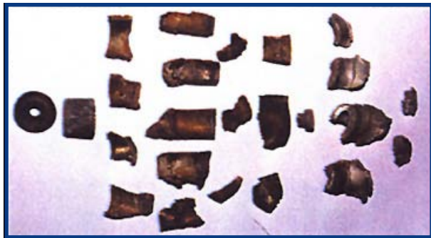
30mm PIE-T Ammunition Fragmentation