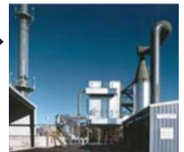
Air Pollution Control System