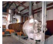
Rotary Kiln Incinerator