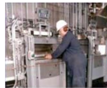
Kiln Feed Room

The advanced closed disposal technology system works to optimize safety and protect health and the environment.