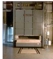
Car Bottom Furnace